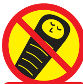
Sleeping outdoors is not allowed here.