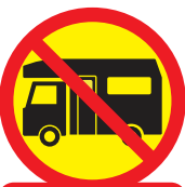
Long-term parking is not allowed here.

Bad manners are distressful to everyone using the facilities.