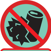
Littering is not allowed here.