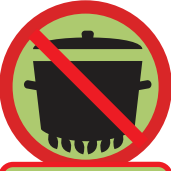
Cooking is not allowed here.