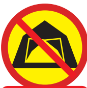
Pitching a tent is not allowed here.