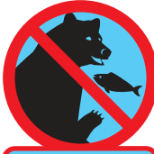
Feeding wildlife is not allowed here.

Mana-chan was embarrassed to find vehicles that remained parked for days at roadside stations. vol.1